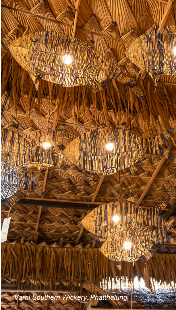
Varni Southern Wickery, Phatthalung

“Creative tourism is travel directed toward an engaged and authentic experience, with participative learning in the arts, heritage, or special character of a place, and it provides a connection with those who reside in this place and create this living culture.”