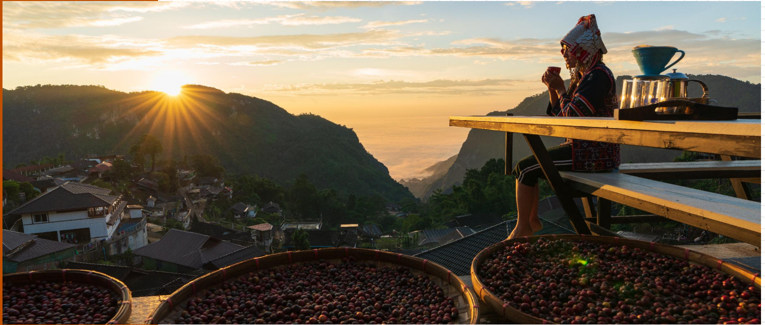
Pha Hi Village, Chiang Rai